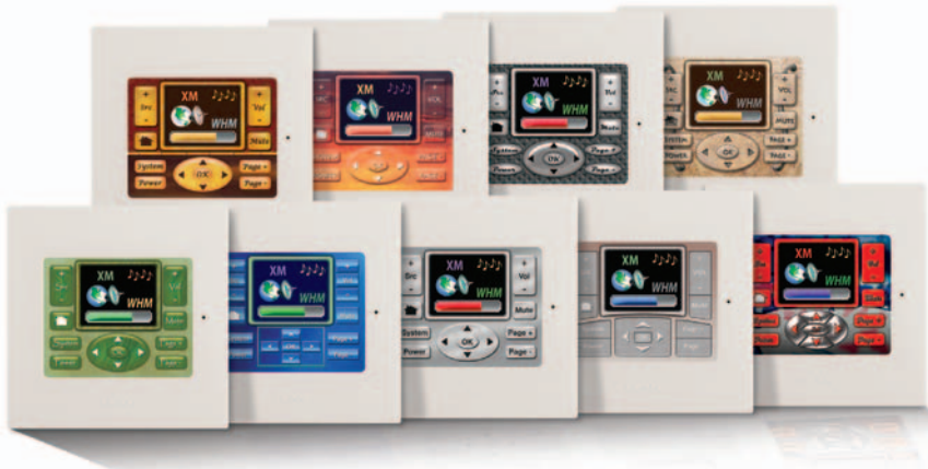
At left, Olé XL touchpanel families (top row) VIA! Match, Scenes, Contempo, Stones, (bottom row) Gems, Computer Match, Keypad Match, Traditional & Themes.