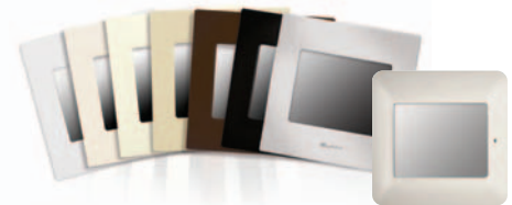
Seven Frame color options (above) are available in Standard and Euro. From left to right: White, Light Almond, Almond, Ivory, Brown, Black & Satin Chrome. Euro Style shown at right in White.